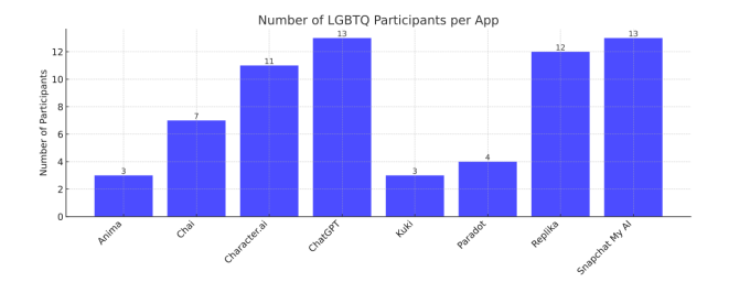
(b) Usage of chatbots by LGBTQ participants